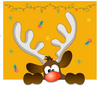
What is Christmas? It is tenderness for the past. courage for the present. hope for the future.

Greeting of the Month: In anticipation of the arrival of Santa from the North Pole later this month this month's greeting is Ho Ho Ho!